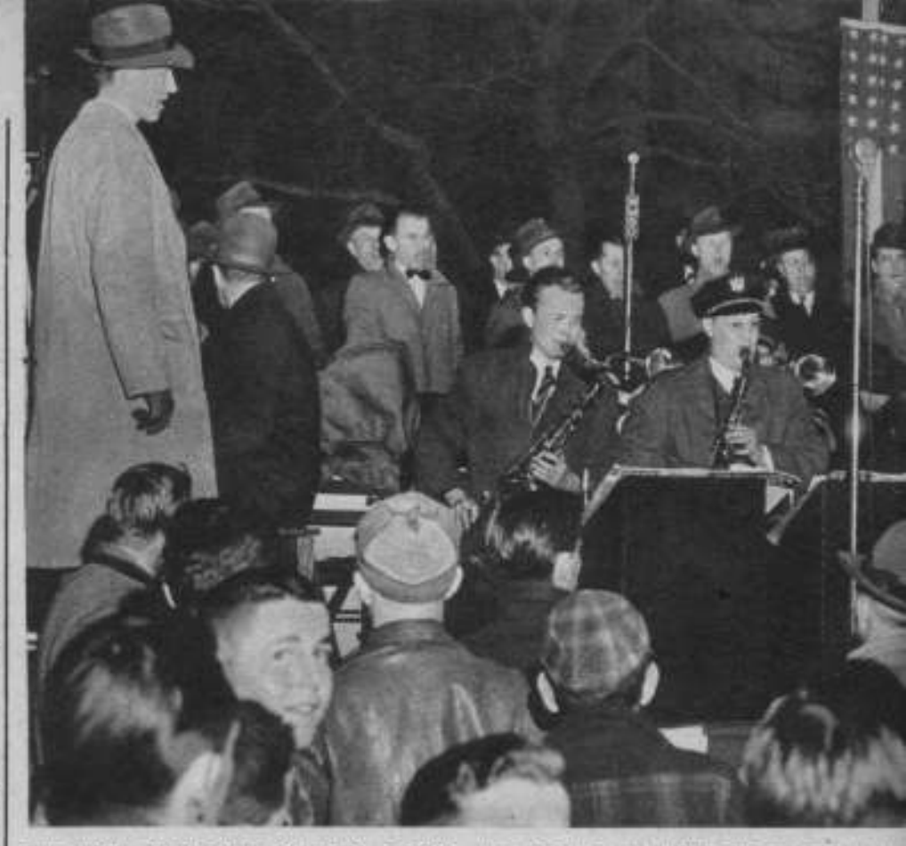
THIS NIGHT SCENE TAKEN OF WMBD's SECOND WAR LOAN RALLY, WITH THE TRACTOR BAND