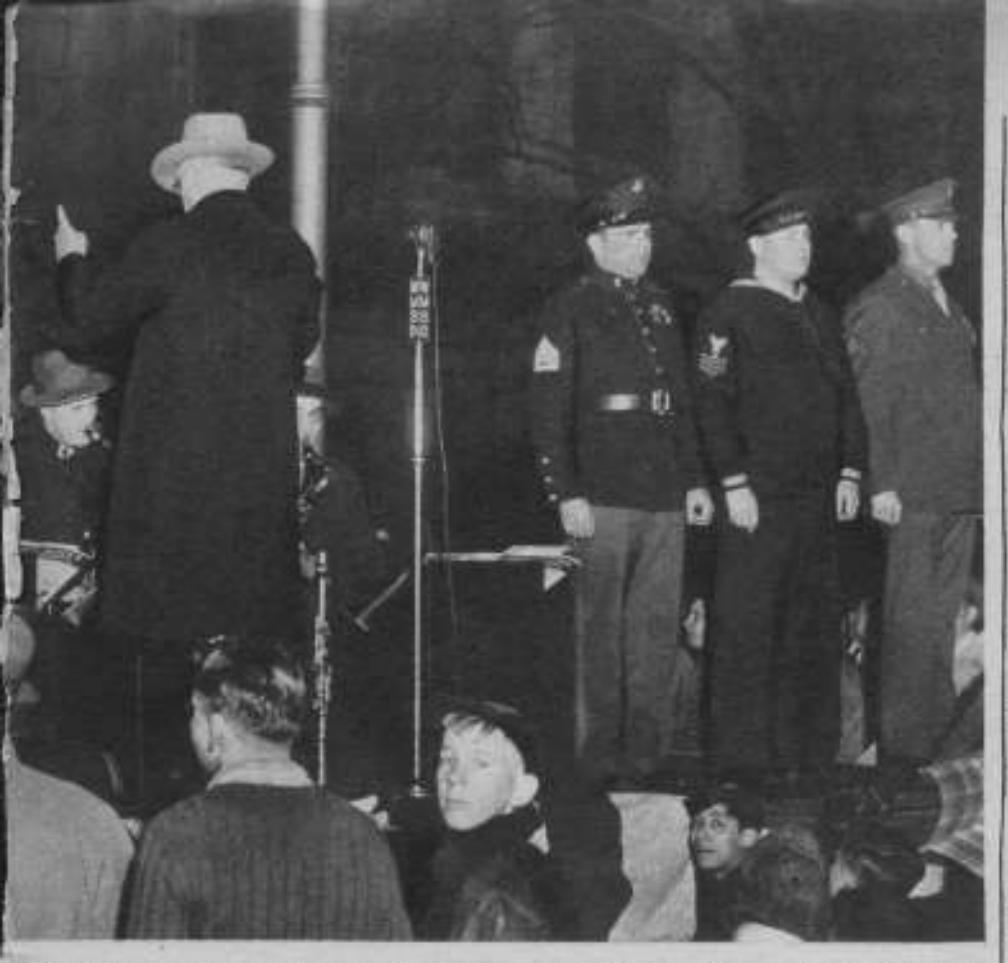
FURNISHING THE ENTERTAINMENT, SHOWS ENTHUSIASTIC PEORIANS TURNING OUT TO CONTRIBUTE