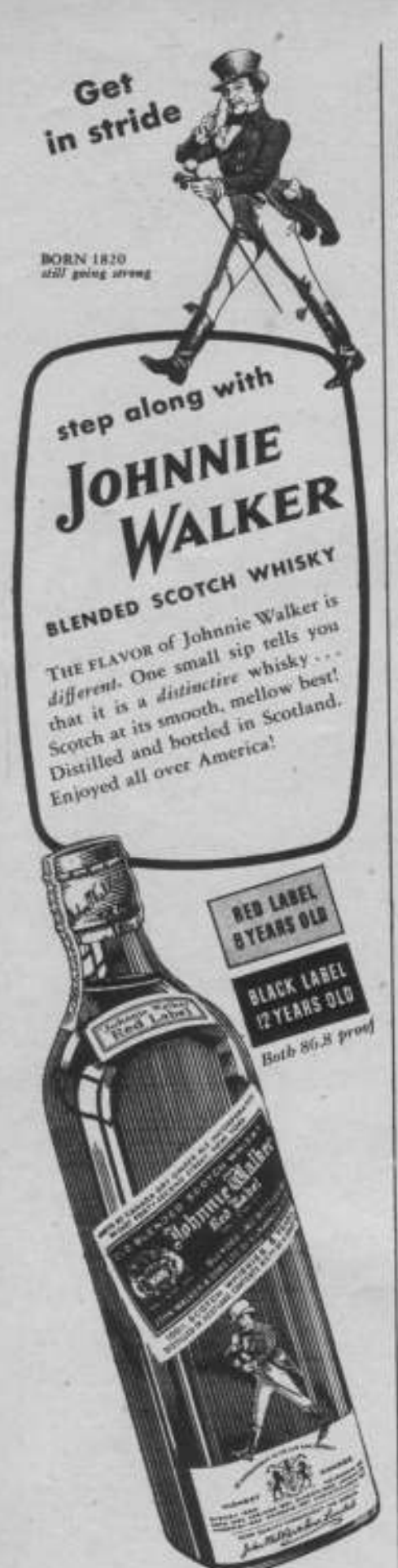
CANADA DRY GINGER ALE, INC., New York, N. Y., Sole Importer