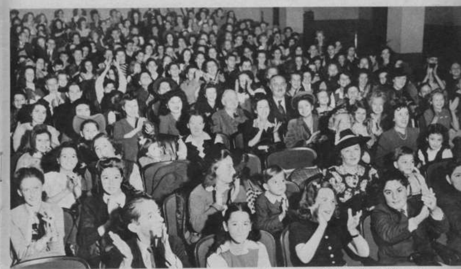
STUDIO AUDIENCE This is a typical audience that appears at every broadcast to applicate and lend encouragement to youngsters who have come from every walk of life to get their initial start in Radio. The Philadelphia program is a high goal.