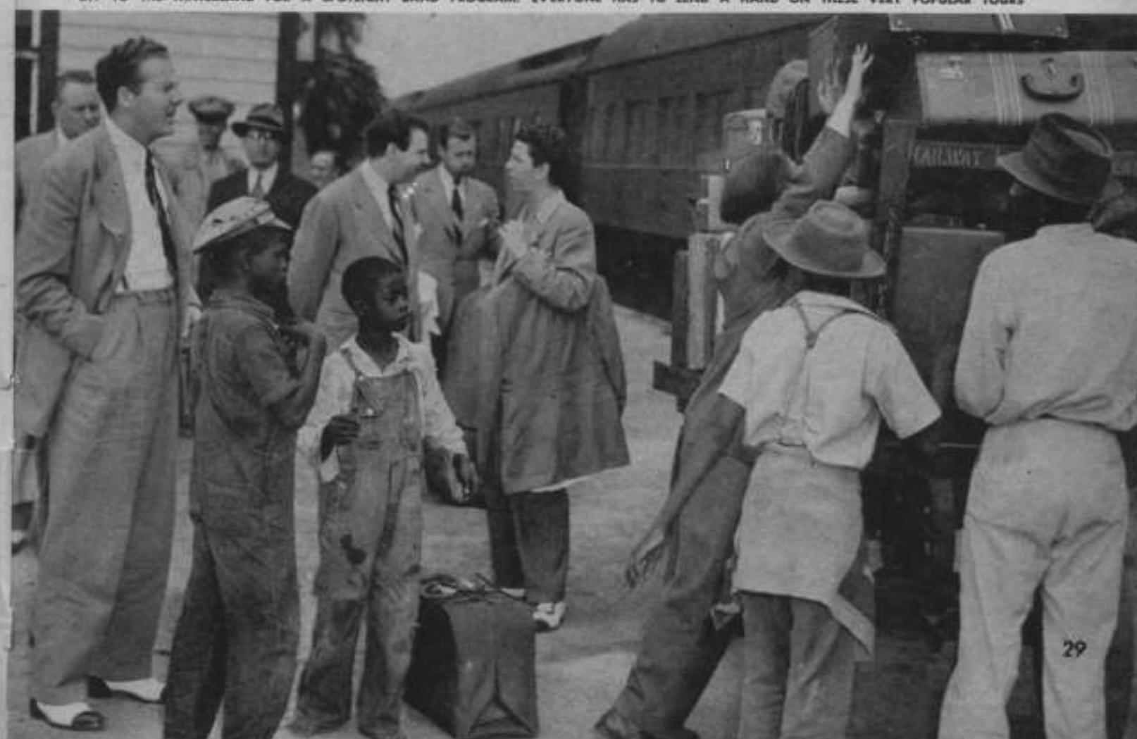
OFF TO THE HINTERLAND FOR A SPOTLIGHT BAND PROGRAM. EVERYONE HAS TO LEND A HAND ON THESE VERY POPULAR TOURS