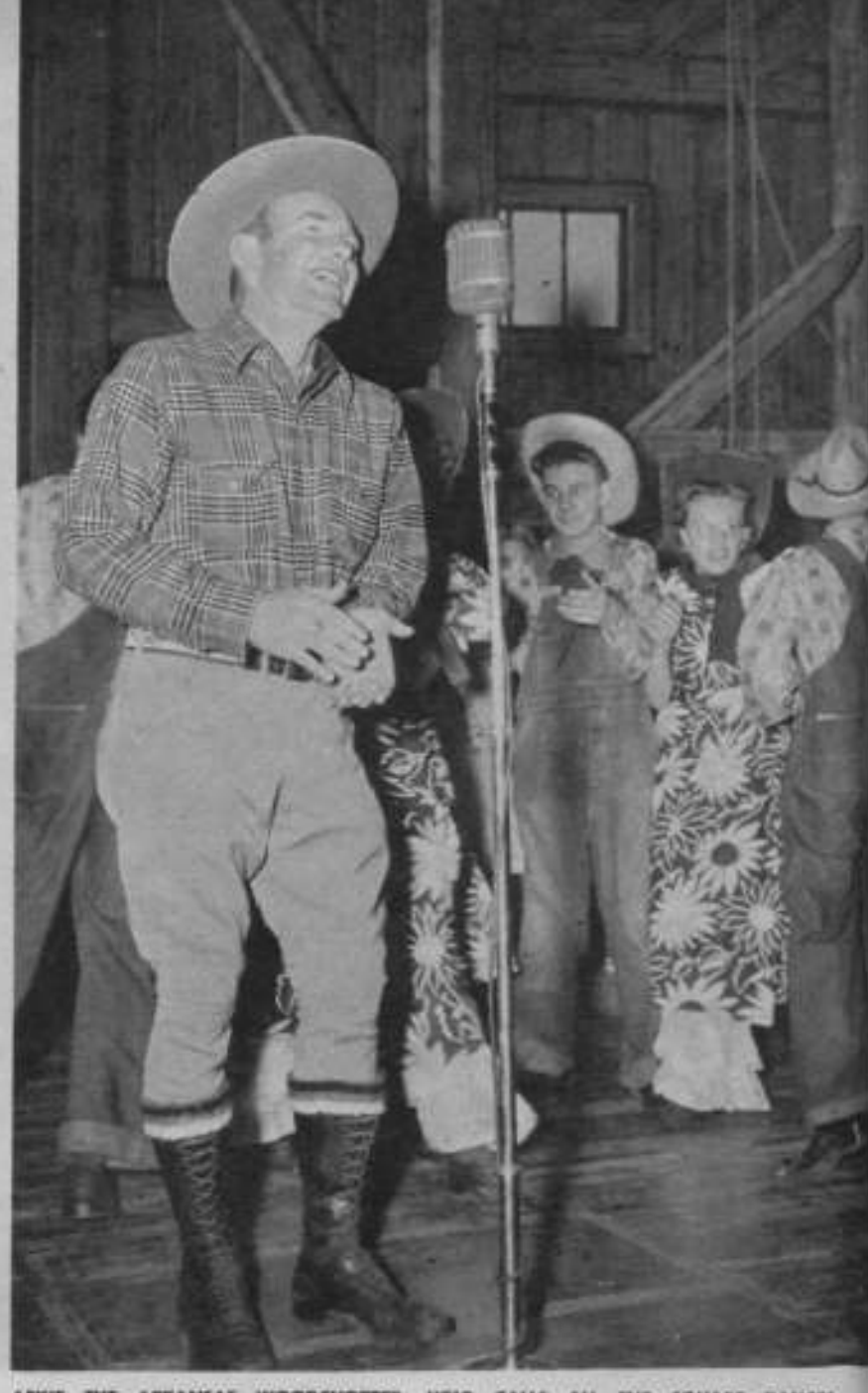
ARKIE THE ARKANSAS WOODCHOPPER, WHO CALLS ALL THE SQUARE DANCES