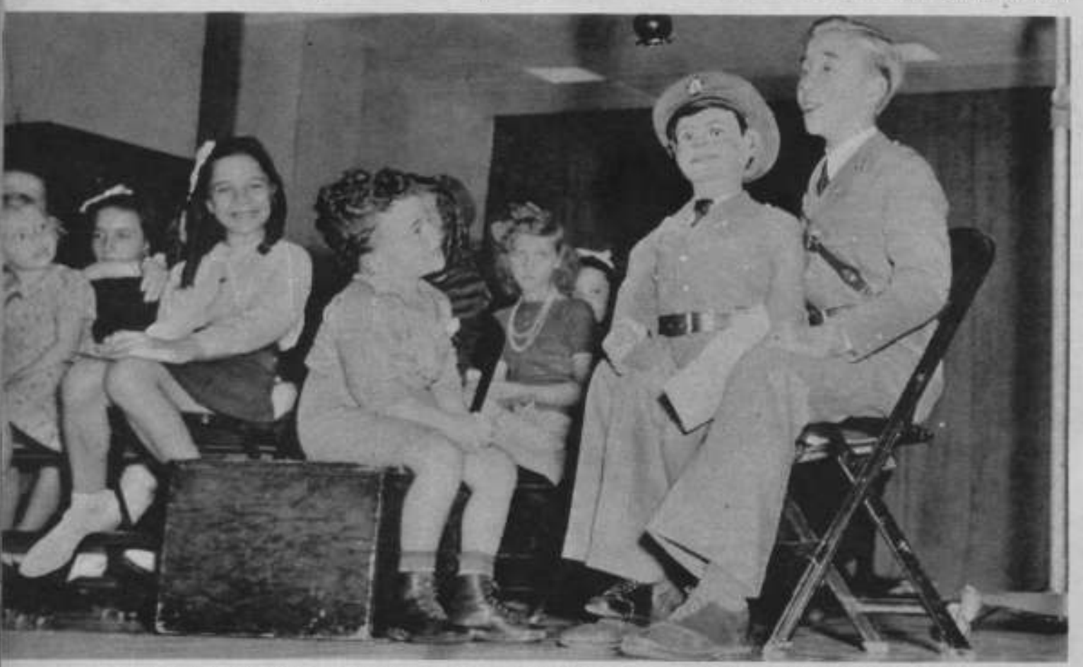
ON THE AIR A typical scene from the program when youngsters make their trial debut. There is no feeling of jealousy, such as you might perhaps expect, only a wholesome, enjoyable amusement on the part of each participant for a new performer.

And many other of its graduates are now in the biggest show of all—the Air Corp, the Bluejackets, Uncle Sam's Army, and the fighting Marines. Such is the record—and an excellent record it is too—of a Philadelphia Institution.