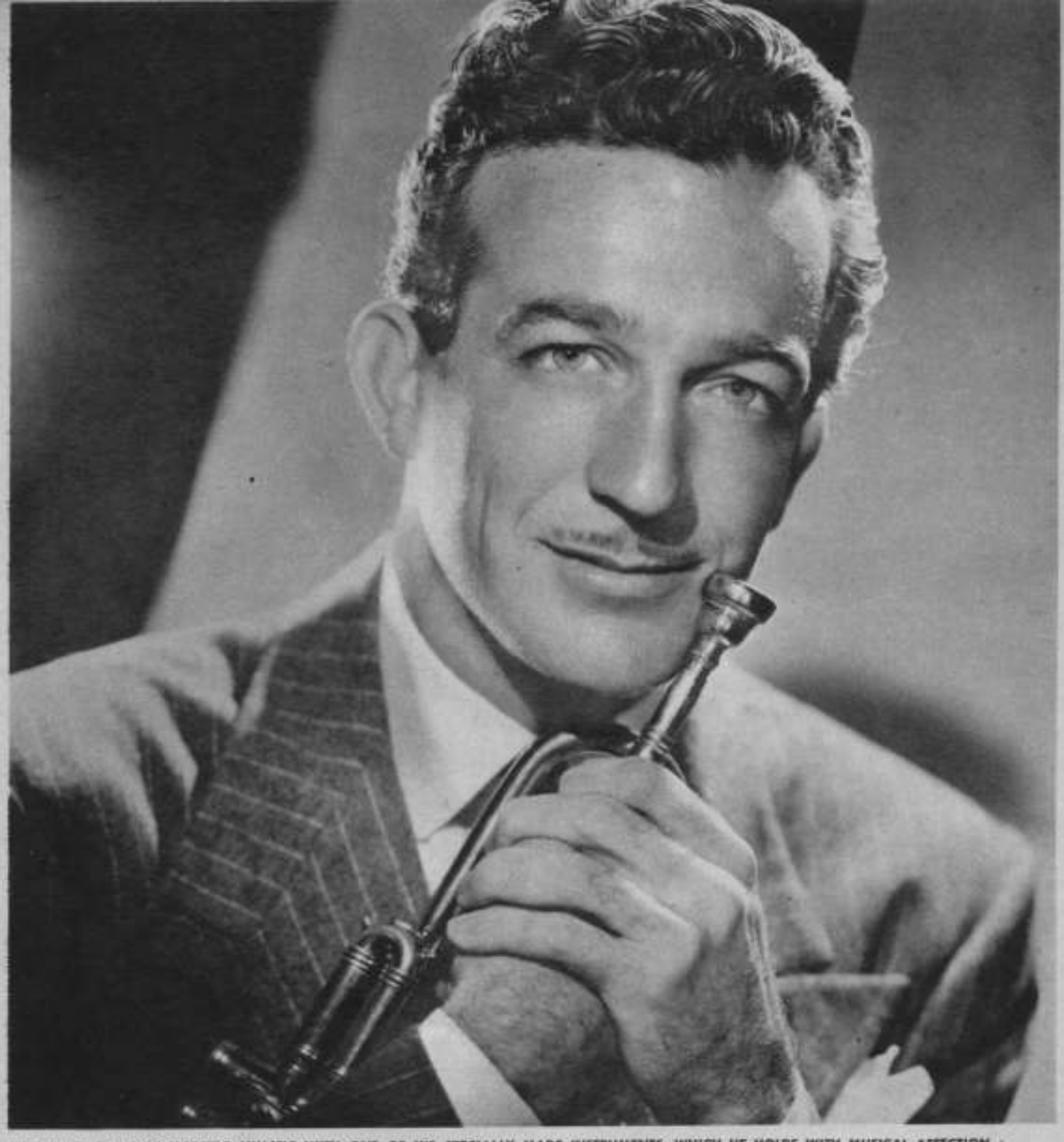
THE SWEET AND HOT MAESTRO HIMSELF WITH ONE OF HIS SPECIALLY MADE INSTRUMENTS, WHICH HE HOLDS WITH MUSICAL AFFECTION