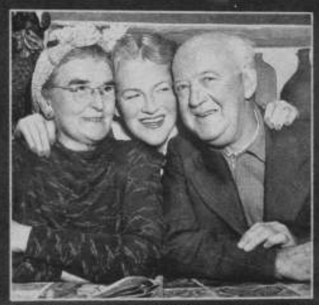
The whole temperable family of Gracie Fields lives with her in the Hollywood mansion. Here is Gracie with her parents.