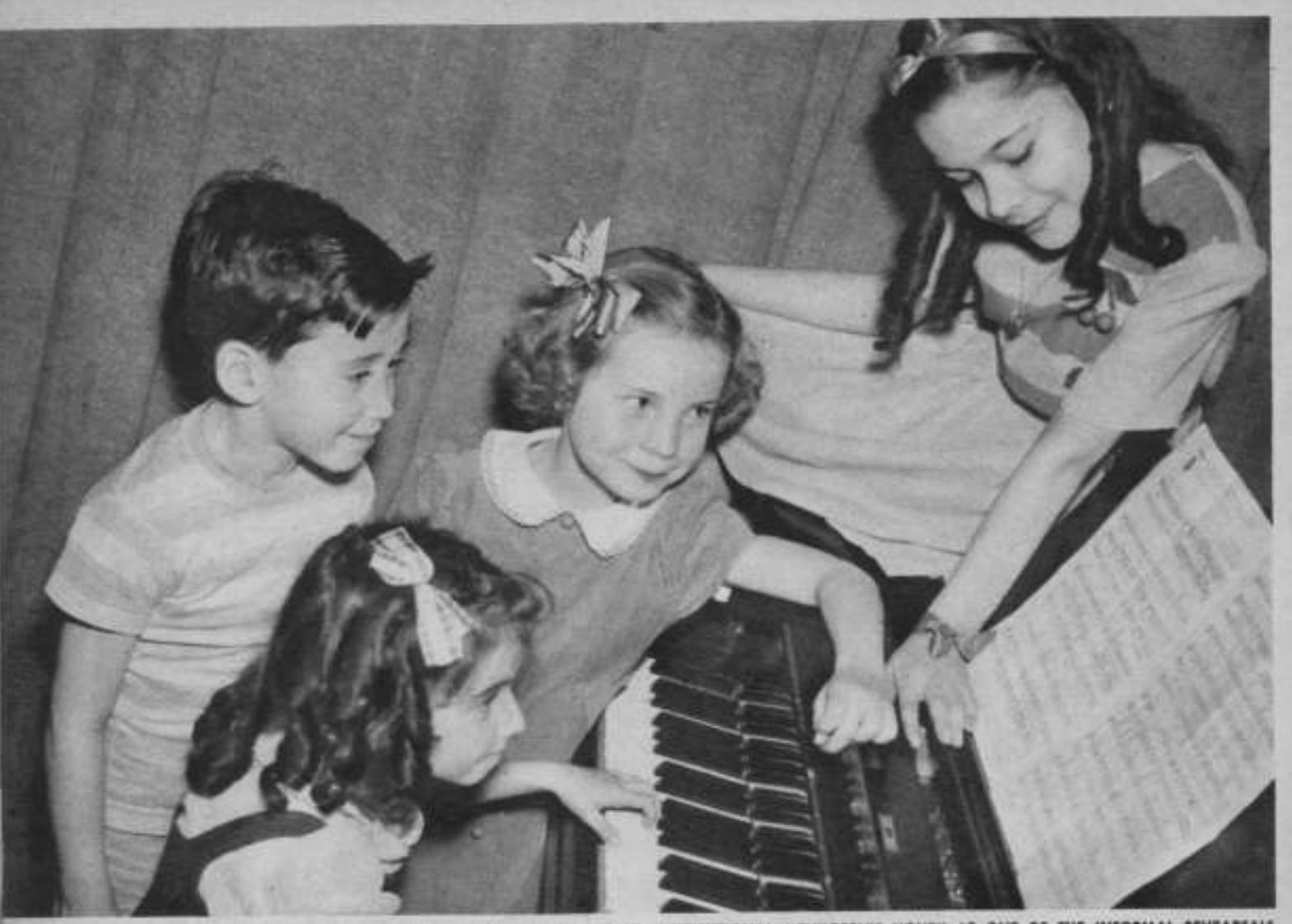
HERE ARE FOUR OF THE YOUTHFUL "REGULARS" ON WCAU'S INSTITUTIONAL "CHILDREN'S HOUR" AT ONE OF THE INFORMAL REHEARSALS