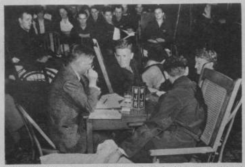
Detroit, Mich.—Station W.R.—They took their round table broadcast to the hospital, and Station W.JR says this is the first broadcast of the kind, It is the Percy Jones General Hospital at Bartle Creek, Mich. The wounded men who took part had just returned from Guadalcanal.