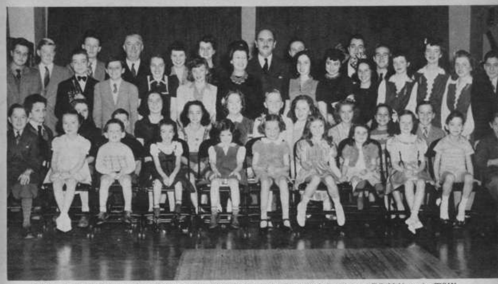
CAST Here is a large group of regular performers on the "Children's Hour" heard each Sunday morning over Philadelphias station WCAU. They range in age from two to fifteen, and the Permanent Cast numbers over one hundred children. Writers are in back.